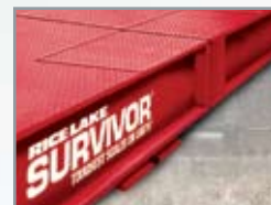
SURVIVOR® OTR Top access, low profile concrete or steel deck