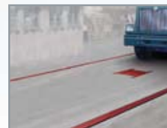
SURVIVOR® PT Pit-type concrete or steel deck scales