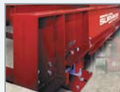
SURVIVOR® SR Extreme-duty, low profile concrete or steel deck siderail scales