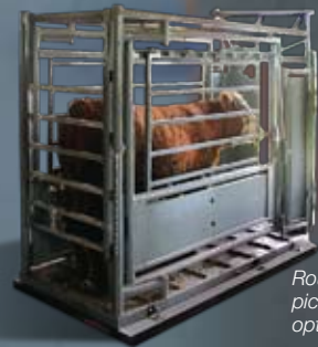
RoughDeck SLV pictured here with optional chute