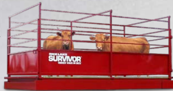
SURVIVOR LS Series pictured here with custom racks and gates.

In a market crowded with scales manufactured to compete on price alone, Rice Lake's livestock scales are built from the ground up for lasting performance under the most severe conditions. Whether you choose the RoughDeck™ SLV single animal scale or the SURVIVOR® AG, LV or LS, you're getting the Toughest Scale on Earth.™